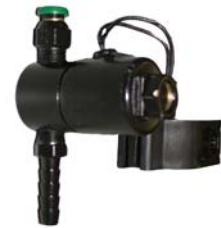
Electronic Solenoid Valve