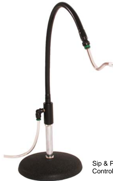
Sip & Puff Breath Delivery System Controllers Not Shown

Richardson Products introduces a very cost effective Sip & Puff System. Our Sip & Puff is comprised of a Breath Delivery System and your choice of Controller. This design easily interfaces to all wheelchairs and to most wheelchair breath control electronics. Our Sip & Puff will provide access to many electronic devices that operate by low voltage switch closures. The Sip & Puff Breath Delivery System can be used on a desktop or it can be directly mounted to the frame of any wheelchair. Our award winning quick disconnect design has a small flexible gooseneck that may be adjusted to any position. We offer a lifetime warranty on the electronic-pneumatic Sip & Puff Switches used in all of our controllers.