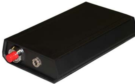
Microprocessor Control Unit